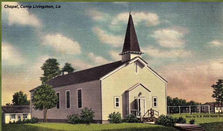
Chapel at Camp Livingston circa 1941 purchased August 1948. Postcard courtesy of Keith LaCour Collection