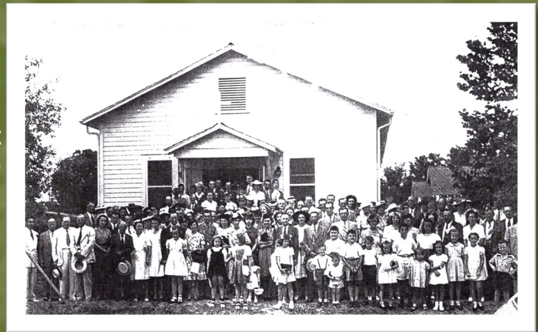
The Chapel on Chester Street after the move from Camp Livingston.

In the 1990s the property was sold to Rapides Council On Aging and the Trinity Methodist church constructed a new building on Bayou Rapides Road. The first service was held in the new building August 2, 1996.